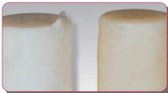
Common Problems when using Aluminum Oxide Plungers. Ceramic material sticks to the plunger. Dimension changes because of cleaning the plunger.