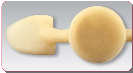
Ceramic button pressed with disposable plunger