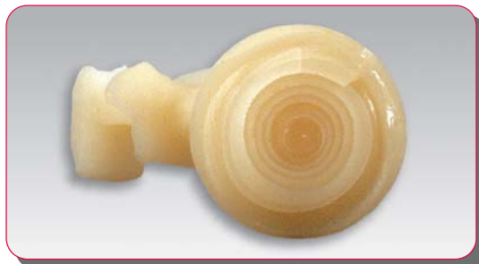
Ceramic button pressed with alox plunger